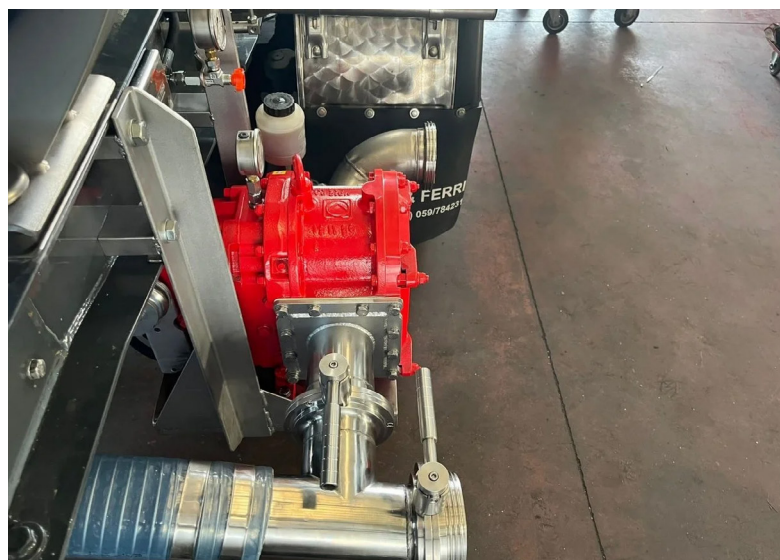
The SL company of Liverani uses the rotary lobe pump

Over the years it has specialized in drainage for private and commercial business, becoming the main point of reference for the ceramic industries of the area, dealing with the suction and transport of aqueous and powdery solid sludge produced by the industries. The main problem encountered following the transfer of this sludge was the wear of the mechanical seals. This wear is caused by the presence of ceramic residues such as glazes and slip in the sludge containing microgranules which, especially during the strong stresses due to the vibration of the pumps installed previously, interpose themselves between the slots of the pump causing the deterioration of the components in contact with the fluid.