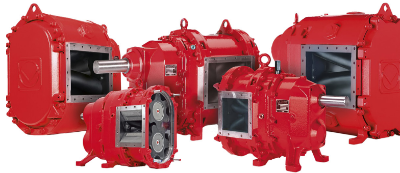
Vogelsang VX series

The feature that most pleased the sewage treatment plant was that all maintenance and service work could be performed easily on-site, without dismantling the pump, due to the QuickService design.