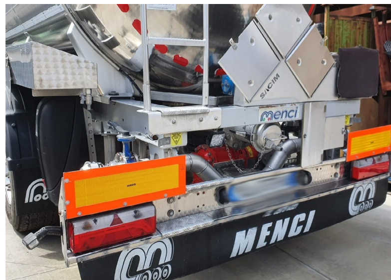
Truck with a tanker at Sassuolo Spurghi

Over the years it has specialized in drainage for private and commercial business, becoming the main point of reference for the ceramic industries of the area, dealing with the suction and transport of aqueous and powdery solid sludge produced by the industries. The main problem encountered following the transfer of this sludge was the wear of the mechanical seals. This wear is caused by the presence of ceramic residues such as glazes and slip in the sludge containing microgranules which, especially during the strong stresses due to the vibration of the pumps installed previously, interpose themselves between the slots of the pump causing the deterioration of the components in contact with the fluid.