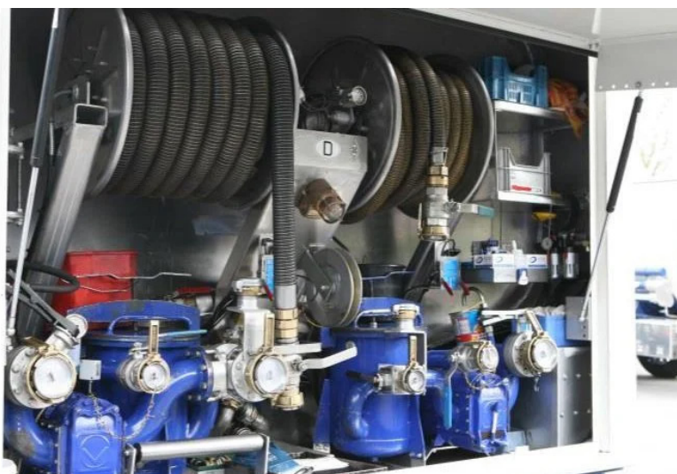
Vogelsang rotary lobe pumps VX series

Over one hundred pumps are needed in the company. Sometimes three pumps as well as piping are installed on a single tanker. This is because the tank is divided up into three sections that each take in different media. In order to ensure optimum recycling, brake oils, glycols and water/oilwater mixtures must be collected in pure form. However, for this configuration KS-Recycling required small pumps.