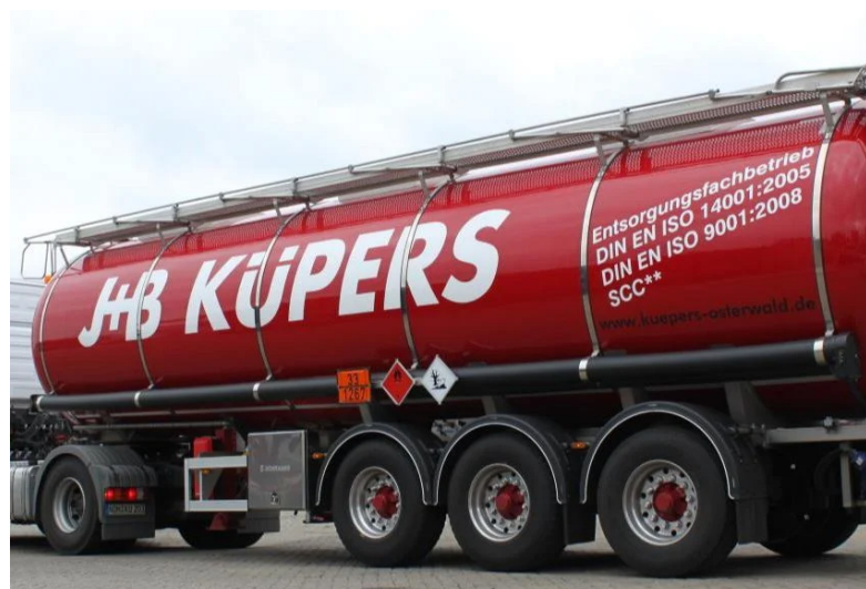
Tank truck, J+B Küpers GmbH

J+B Küpers was looking for a solution for loading and unloading their thermo trailers for petrochemical applications. The pumps for this kind of application need to satisfy several requirements, such as space and weight requirements to be installed in a tanker without occupying much space or weight. They have to be versatile and chemical resistant to be able to pump different fluids, some of them with a high viscosity. Another very important factor is the reversible direction of flow that enables the vehicle to be loaded and unloaded with a single pump.