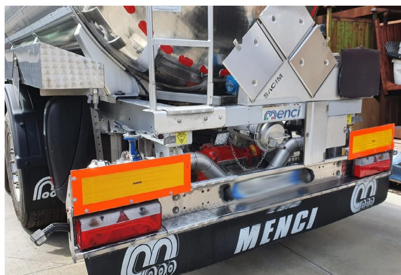
Truck with a tanker at Sassuolo Spurghi

Over the years it has specialized in drainage for private and commercial business, becoming the main point of reference for the ceramic industries of the area, dealing with the suction and transport of aqueous and powdery solid sludge produced by the industries. The main problem encountered following the transfer of this sludge was the wear of the mechanical seals. This wear is caused by the presence of ceramic residues such as glazes and slip in the sludge containing microgranules which, especially during the strong stresses due to the vibration of the pumps installed previously, interpose themselves between the slots of the pump causing the deterioration of the components in contact with the fluid.