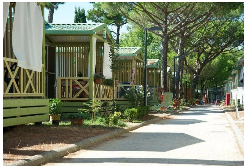
Camping Piper in Italy

For the Pecchia family that means, they need to open the underground pit, pulling out the pump and solve the clogging. In addition to the extra effort of 3-4 hours each time in the strainful summer season, unpleasant odors come out of the pit and affect the camping experience of the guests.