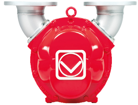
Vogelsang IQ series

„We then found out about the new IQ series from Vogelsang at IFAT,“ says wastewater manager Sternkiker. „The compact type of construction is very handy for us, given the lack of space in our pump room. The flexible connectors parts made it easy to connect the pump to the pipe system. Despite our well-functioning screen, we’re constantly finding foreign matter in the sludge, so we liked the higher resistance to foreign matter provided by the integrated InjectionSystem. And even if a clump does clog the pump, the quick and easy access to the pump chamber and pumping elements means that we can fix the malfunction very quickly – unlike with our progressive cavity pumps,“ says Sternkiker, explaining why he decided to buy the IQ pump.