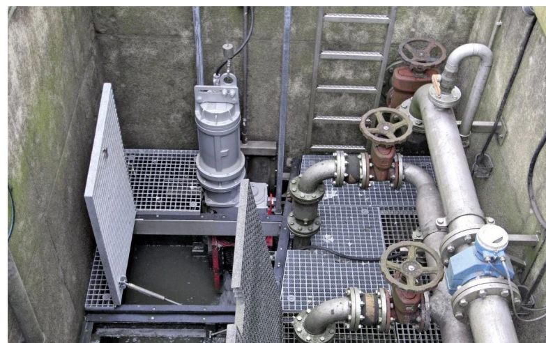
Vogelsang wastewater grinder XRipper XRC SIK

Talking to Vogelsang, an ideal solution came to the attention of plant supervisor Wissing: the XRipper XRC-SIK wastewater grinder. With its monolithic rotors, the XRipper masters even stubborn coarse matter reliably. With its carefully engineered design, it can be installed with little effort in front of the inlet in the open pump pit.