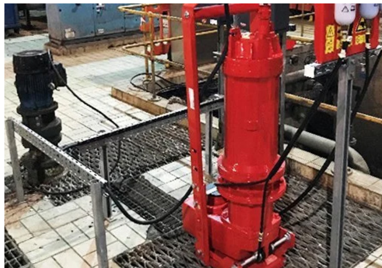
Wastewater grinder Vogelsang XRipper XRC-SIK

Scottish Water Services (Grampian) installed twin shaft grinders at the inlet works of the Nigg site a number of years ago, in order to protect downstream pumping equipment and to improve the efficiency of the screening. Whilst they were happy with the general function of the grinders, the ongoing cost of ownership was a growing concern. These grinders did not allow for easy maintenance and could not be serviced by their own engineers, resulting in frequent overhauls carried out off-site and creating expensive and time-consuming repairs.