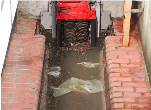
Image 1: The Ripper rotors shred disruptive matter in the wastewater, thereby protecting the downstream pumps and valves.