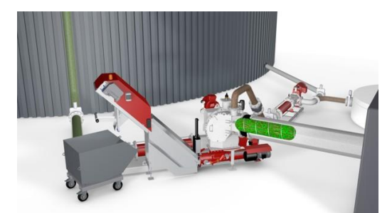
Image 1: Debris Lift Unit (DLU): fully automatic heavy material disposal during operation.