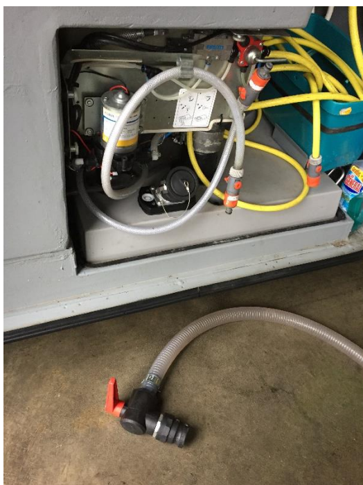
Image 3: The suction nozzle PumpPlug is attached directly to the fecal matter tank of the bus.