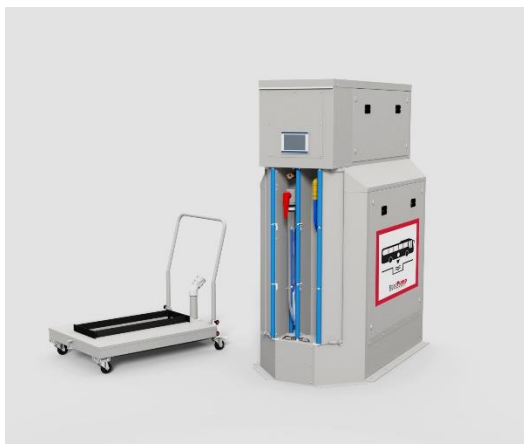
Image 1: The Vogelsang RoadPump Plus with integrated collecting trolley CollectingMax.