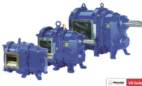
Image 2: VX series – rotary lobe pump for media containing foreign matter