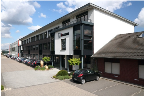
Image 1: The main Vogelsang building at the company's headquarter in Essen/Oldb., Germany