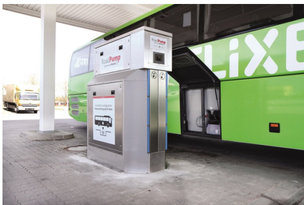
Image 3: The award-winning RoadPump Plus for wastewater disposal from long-distance buses.