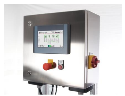
Image 4: Performance Control Unit – intelligent control and independent fault rectification for automatic system operation.