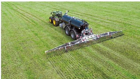
Image 1: The new BlackBird trailing shoe linkage from Vogelsang offers precise liquid manure spreading and high stability.