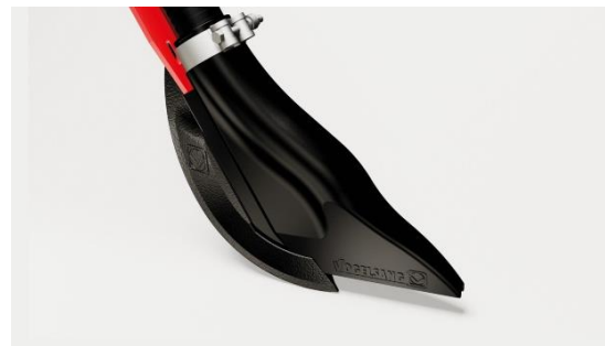
Image 2: The beak-like shoe shape allows for a controlled flow of liquid manure, thus making it possible to deposit the manure under the crops with a high level of precision.