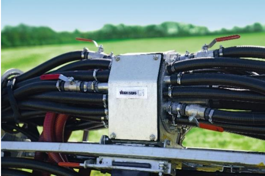
Image 3: The next-generation ExaCut ECQ is located in the centre of the boom and ensures that the liquid manure is distributed evenly.